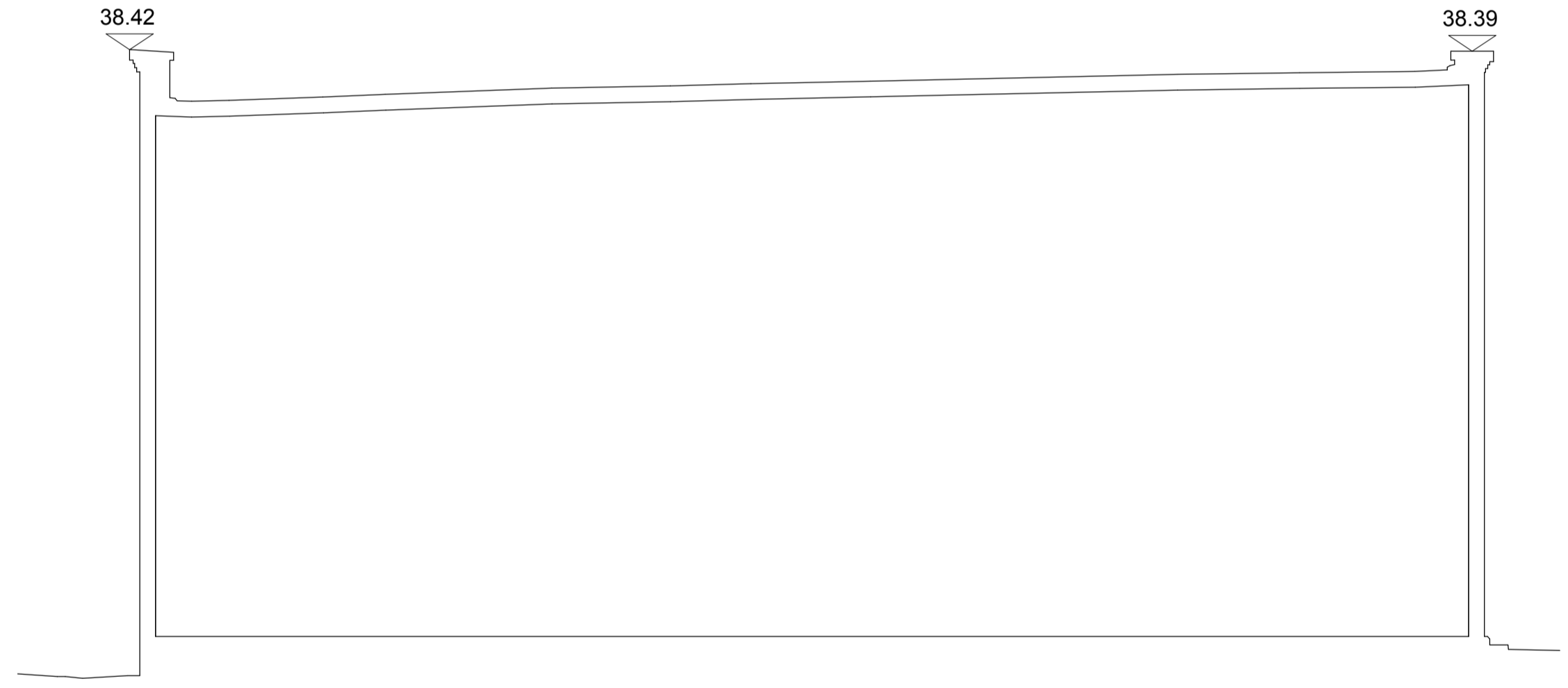
E SECTION SECTION E-E 1 : 100